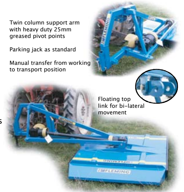
Twin column support arm with heavy duty 25mm greased pivot points