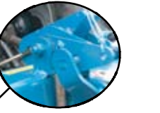
Spring release operated safety latch for when in the transport position