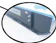
Adjustable cutting height from 50mm - 200mm