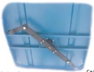
Specially designed hard-wearing Hardened steel blades with offset flute to disperse grass evenly.